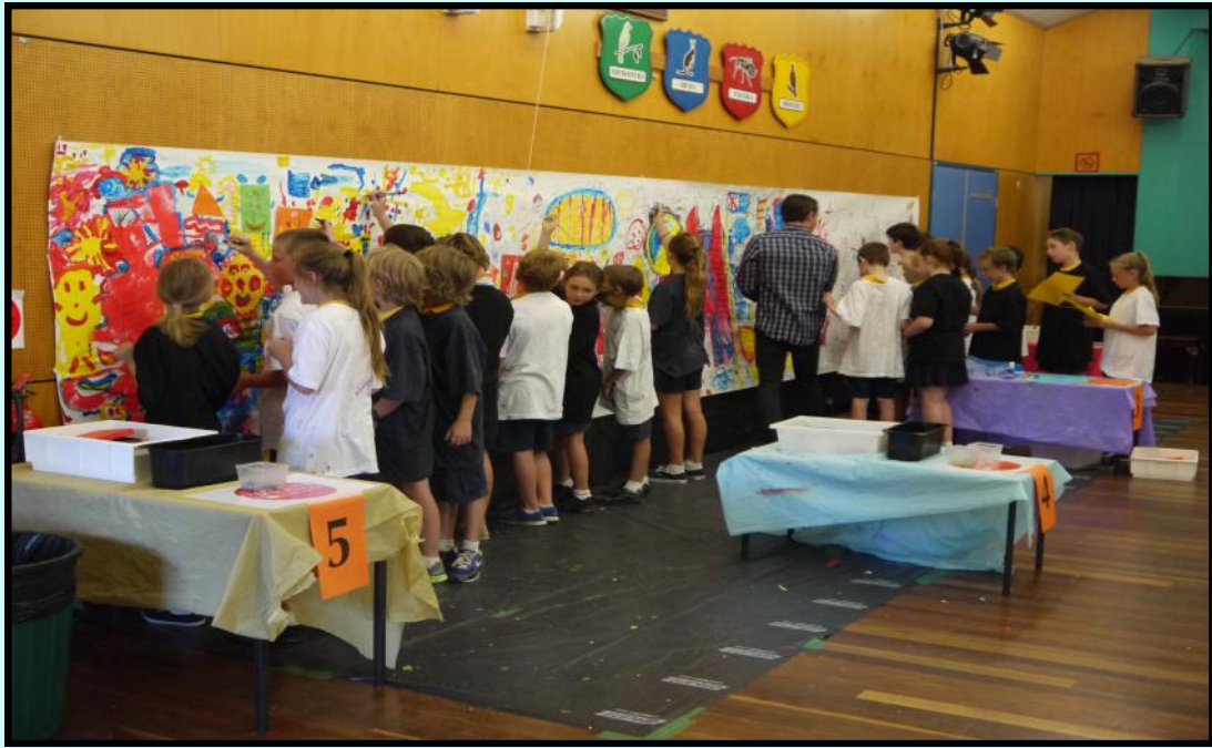
ART WORKSHOP –Mural on display in the school hall.