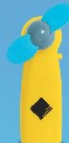
Bush Fly Fan