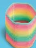
Wiggly Glow Worm