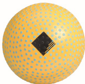
Mighty Boom Handball