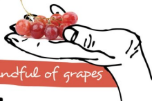
handful of grapes